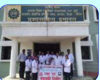
Blood Group Camp at ITI Amgaon