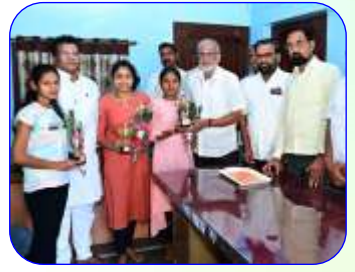
State Winner Award