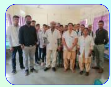
Govt. Hospital Visit