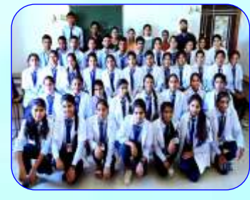
DMLT Session 2021 Batch