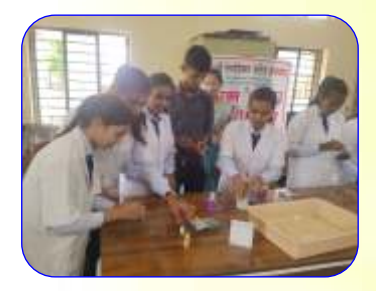
Blood Group Checking Camp at Govt. ITI