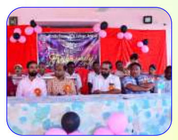
Event of Freshers Party